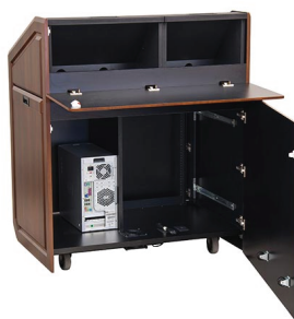
Dual Wedge/Pod Configuration S